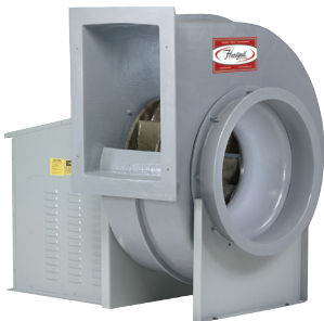
Fiberglass BC Centrifugal SWSI AMCA Certified for Sound & Air