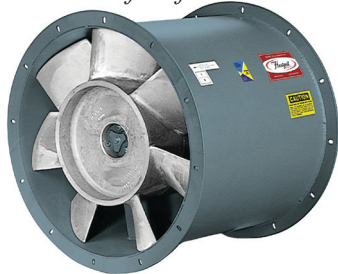
Steel Vaneaxial Fan AMCA Certified for Sound & Air