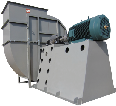
Extra Large Centrifugal Fan AMCA Certified for Sound & Air