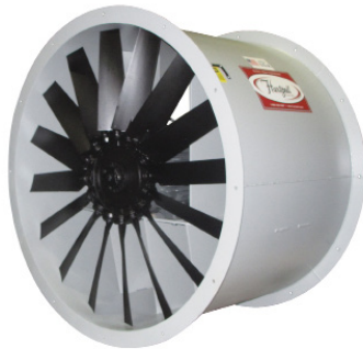
NEW! Marine Duty Duct Axial Blower Pending AMCA certification