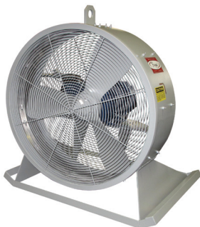
Bug Blower/ Man Cooler