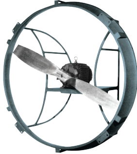
Ring Fan AMCA Certified for Air